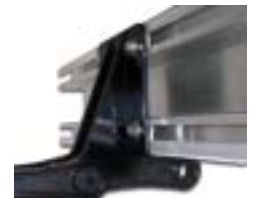
Chain & Flights